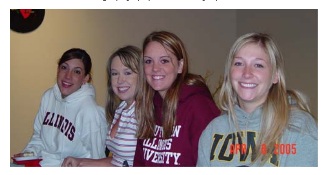
Students in the audience enjoyed the day's various presentations.