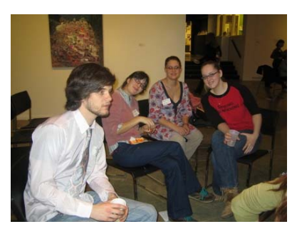
Above: Women's Project presenters visited after their performance.