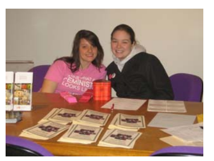
Above: Vagina Monologue tickets were on sale.