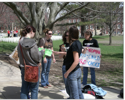
ISU students signed petitions for the Freedom of Choice Act.

On April 16, members of ISU's Catholic Student Association and St. Robert Bellarmine Center demonstrated against choice on the quad. While FLAME did not find out about the demo until that morning, by 11:00 a.m. at least ten women had strategically located themselves, bearing pro-choice posters and petitions supporting the Freedom of Choice Act. They collected over 100 signatures. The women also distributed "Got Choice?" t-shirts (donated by NARAL Pro-Choice America), and passed out stickers with pro-choice messages. Passersby enthusiastically supported the counterdemonstration.