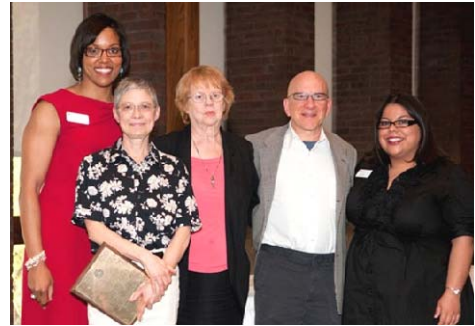
Women's and Gender Studies won the Outstanding Established Program Award, in recognition of our annual Women's and Gender Studies Symposium, at the Dean of Students Diversity Advocacy Awards Ceremony, April 11.

Over the summer, we will be drafting a new five-year plan, which will be put before the faculty for discussion this fall and then finalized. Stay tuned! ☼